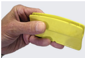
Ideal for window clips