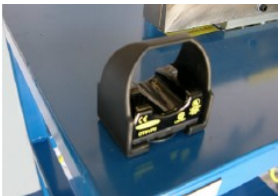
Opto-Touch Cycle Start Button Actuated