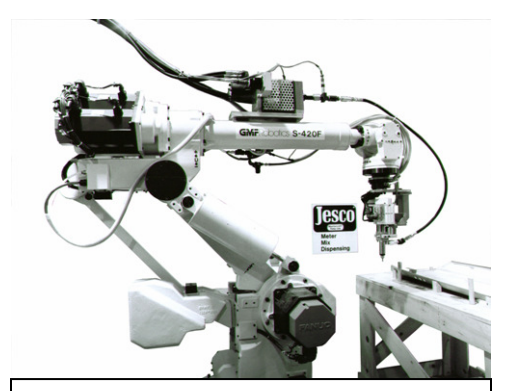
N-3200-AH-GP Series FACTS Dispenser