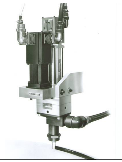
N-2995 Series Analog Electric Gun

The N-3200-GP Series FACTS Dispensers are but one of several different types of Full Analog Control Tracking Systems available from Jesco. These systems are used in demanding applications requiring very precise bead size control and consistency and where Robot cycle times need to be minimized.